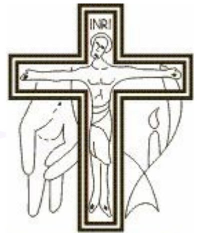
"Christ is counting on You"