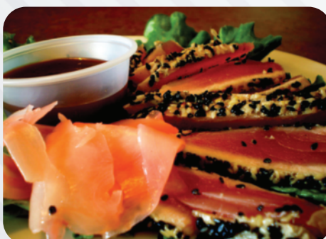
Sesame Seared Tuna

Cheese 1.00 Meat 1.99 Meat & Cheese 2.99 Chicken 5.99 Steak* 9.99 Shrimp 5.99 Crab Cake 17.00 Ahi Tuna* 11.99 Salmon* 14.99 Catch of the Day* (Market)