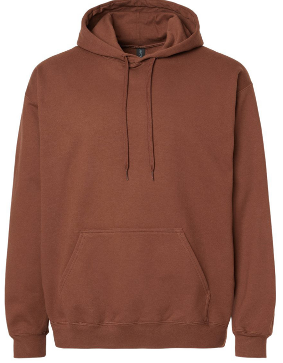
Cocoa 8.4 oz., 80% cotton/20% polyester

Vanilla 8.3 oz., 80% cotton/20% polyester