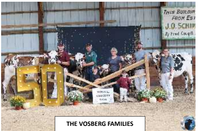
THE VOSBERG FAMILIES