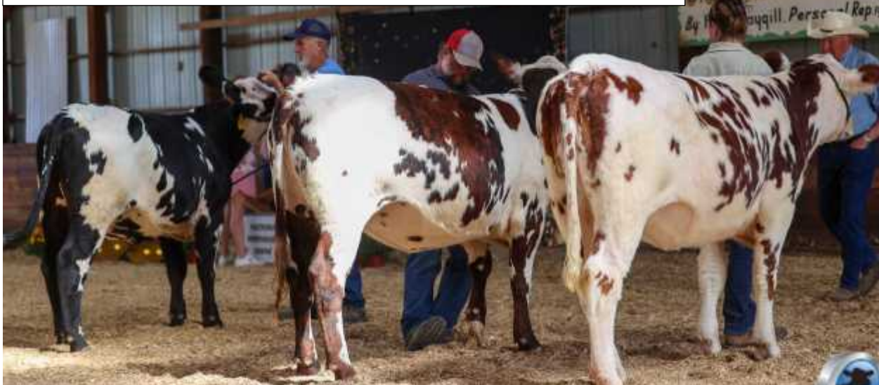
L-R: PDM MYJESTIC JACKSON 049H, DMCC FOOLERMAN LORELLA 7L, DMCC JACKSON LEXA 5L

7L, exhibited by Double M Cattle Company, Rewey, WI. A 95% Normande born 5-14-2023, she is sired by Circle D Foolerman 51R and her dam is DMCC Conqueror Forella 24F.