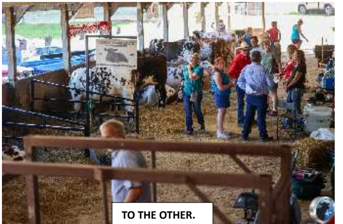
TO THE OTHER.