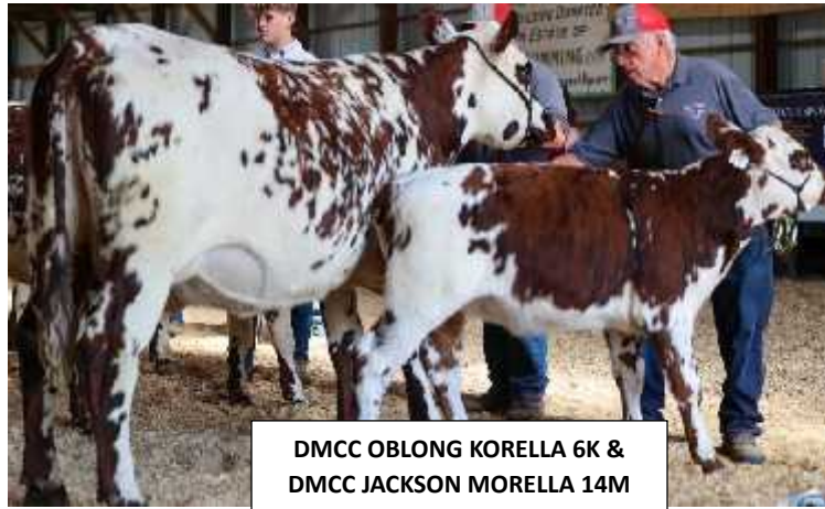
DMCC OBLONG KORELLA 6K & DMCC JACKSON MORELLA 14M

In the Beef Group Classes Nine Mile Farm, Linwood, KS, had the winning Pen of 3 Bulls.