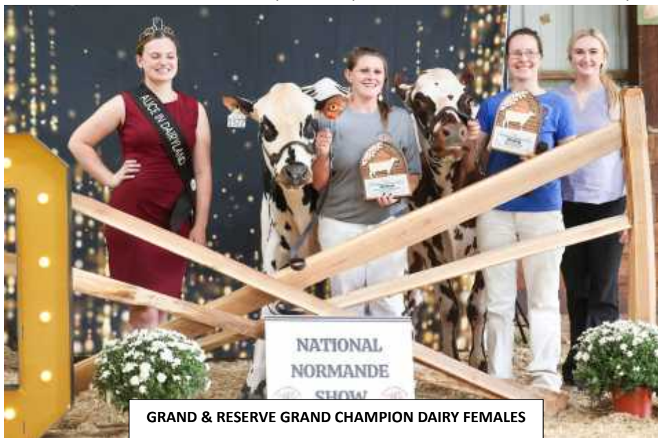
GRAND & RESERVE GRAND CHAMPION DAIRY FEMALES