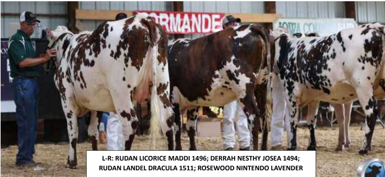
L-R: RUDAN LICORICE MADDI 1496; DERRAH NESTHY JOSEA 1494; RUDAN LANDEL DRACULA 1511; ROSEWOOD NINTENDO LAVENDER

also, she was born 10-30-2022. Her sire is Landel and her dam is Rudan Infinity Doodle 1279. Occupying fourth place was Rosewood Nintendo