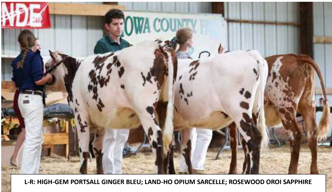
L-R: HIGH-GEM PORTSALL GINGER BLEU; LAND-HO OPIUM SARCELLE; ROSEWOOD OROI SAPPHIRE

The Dairy Spring Heifer Calf Class had four heifers in it that were 95% Normande or higher! Winning the class was High-Gem Piliier Sephora, born 3-18-2024. She is a 97% Normande sired by Piliier. Her dam is High-Gem Licorice Shakira. And she was exhibited by High-Gem Normandes, Neosho, WI. In second place was Rudan Portsall Cosmic 1655. 98.5% Normande she is a daughter of Portsall born 4-15-2024. Her dam is Rudan Loky Cokacola 1401 and she was exhibited by Vosberg Vally View Farm, South Wayne, WI. In third was Thunderstruck Tulip, born 3-31-2024. Shown by Thunderstruck Acres, Luxemburg, WI, she is 95% Normande. Her sire is Goose Hill Nemesis and her dam is Rudan Haliba Tequila. Placing fourth was Fiat Riddick Premier Petunia, a 99% Normande shown by Fiat Farm, Bethel, MN. Born 5-10-2024, her sire is Riddick and her dam is Miller Tyme Diva.