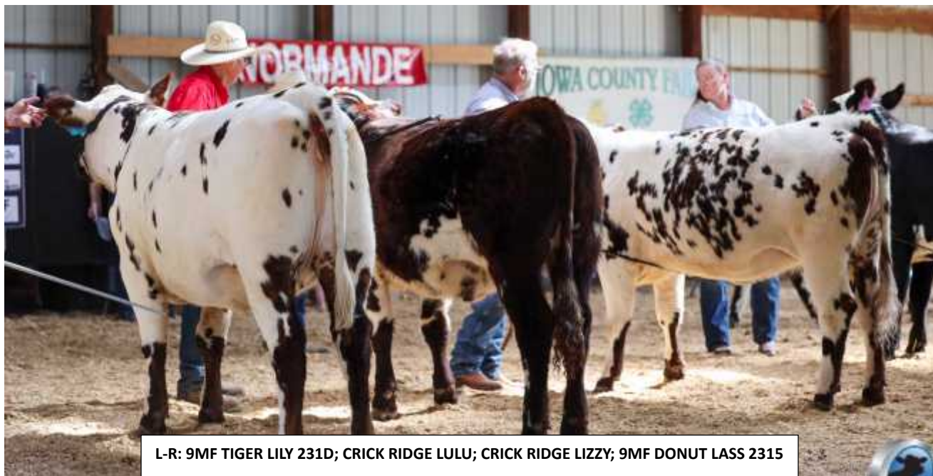
L-R: 9MF TIGER LILY 231D; CRICK RIDGE LULU; CRICK RIDGE LIZZY; 9MF DONUT LASS 2315

In third place was DMCC Jackson Lexa 5L. Born 5-7-2023, her sire is SNF Jackson 902J and her dam is DMCC Fukrain Jubilee 42J. Also shown by Double M Cattle Company, she is 94% Normande