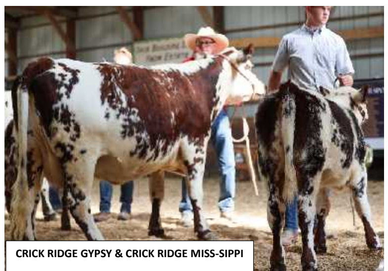
CRICK RIDGE GYPSY & CRICK RIDGE MISS-SIPPI