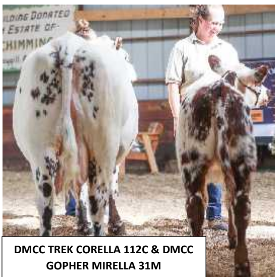
DMCC TREK CORELLA 112C & DMCC GOPHER MIRELLA 31M

The Beef Cow/Calf Pair Class had three entries. In first place was DMCC Trek Corella 112C. Nine years old, she and her heifer calf, DMCC Gopher Mirella 31M made up this cow/calf pair for Double M Cattle Company, Rewey, WI. Corella is 90% Normande and is sired by Crick Ridge Farm Trek 2T. Her dam is MW Jackson Joarelle 15L. Her heifer calf is sired by DMCC Buccaneer Gopher 6G and is 92% Normande. Placing second was the cow/calf pair from Crick Ridge Farm, Spring Valley, WI. Crick Ridge Gypsy, 92% Normande, is sired by DMCC Trek Candyman 113C and her dam is Crick Ridge Anika. Her heifer calf is Crick Ridge Miss-Sippi, who is 91.5% Normande and sired by Crick Ridge Gargoyle. The second entry of Double M Cattle Company stood in third place. She is DMCC Oblong Korella 6K, a 95% Normande sired by Oblong. Her dam is DMCC Trek Corella 112C, the winner of this class. DMCC Jackson Morella 14M is her heifer calf. Sired by SNF Jackson 902J, she is 93% Normande.