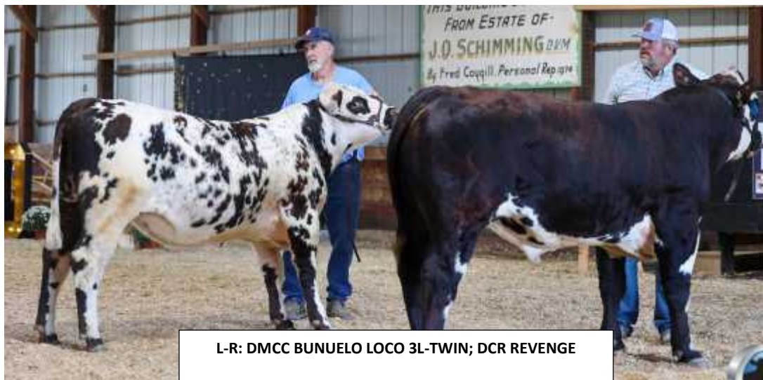
L-R: DMCC BUNUELO LOCO 3L-TWIN; DCR REVENGE