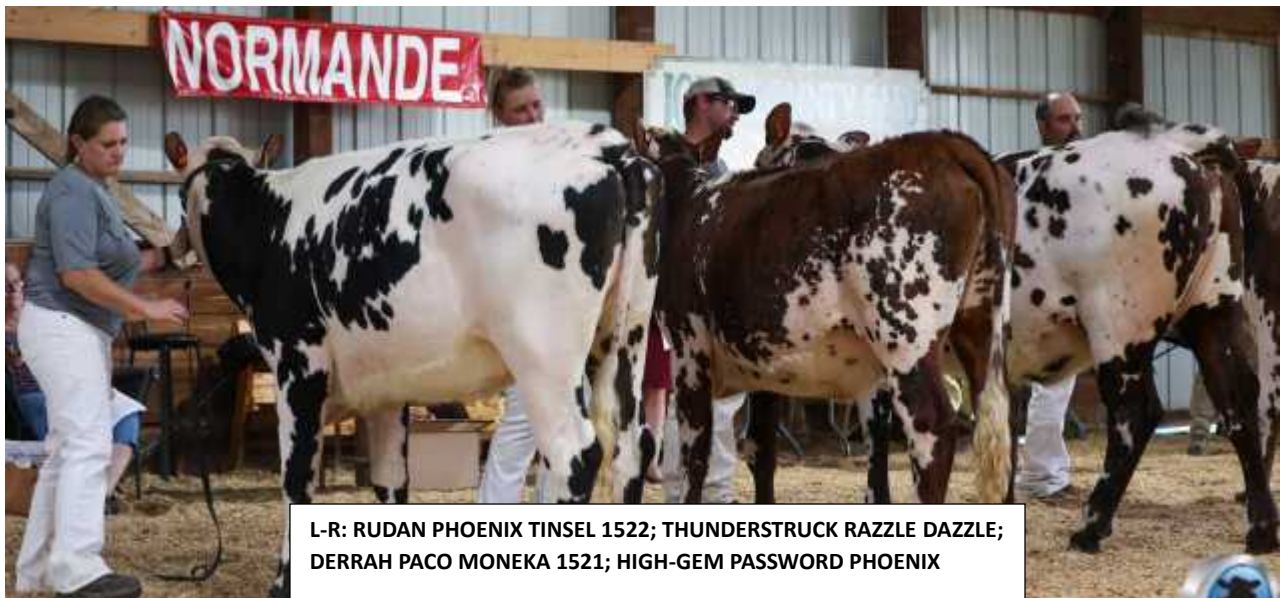
L-R: RUDAN PHOENIX TINSEL 1522; THUNDERSTRUCK RAZZLE DAZZLE; DERRAH PACO MONEKA 1521; HIGH-GEM PASSWORD PHOENIX

Four heifers were exhibited in the Dairy Winter Yearling Heifer Class. Placing first was Rudan Phoenix Tinsel 1522. 88% Normande and sired