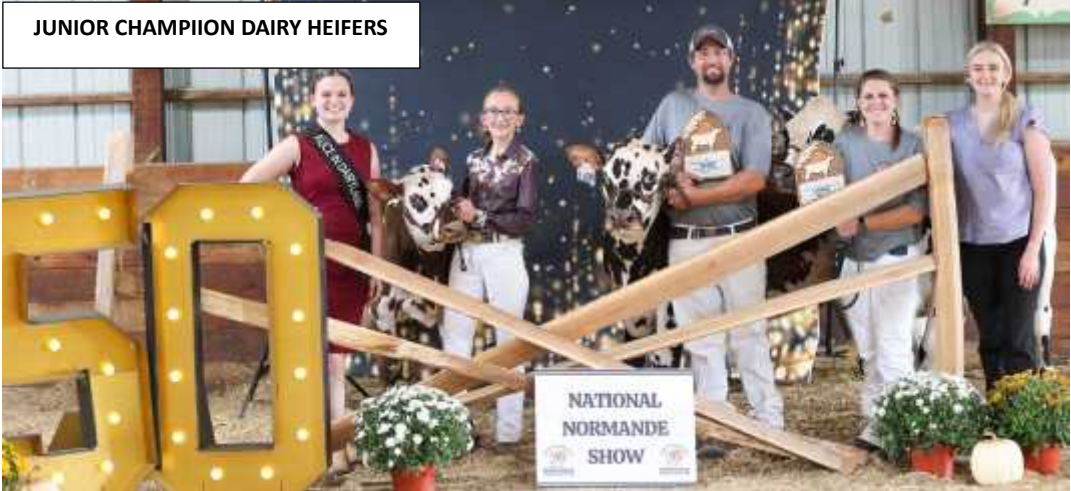
JUNIOR CHAMPIION DAIRY HEIFERS