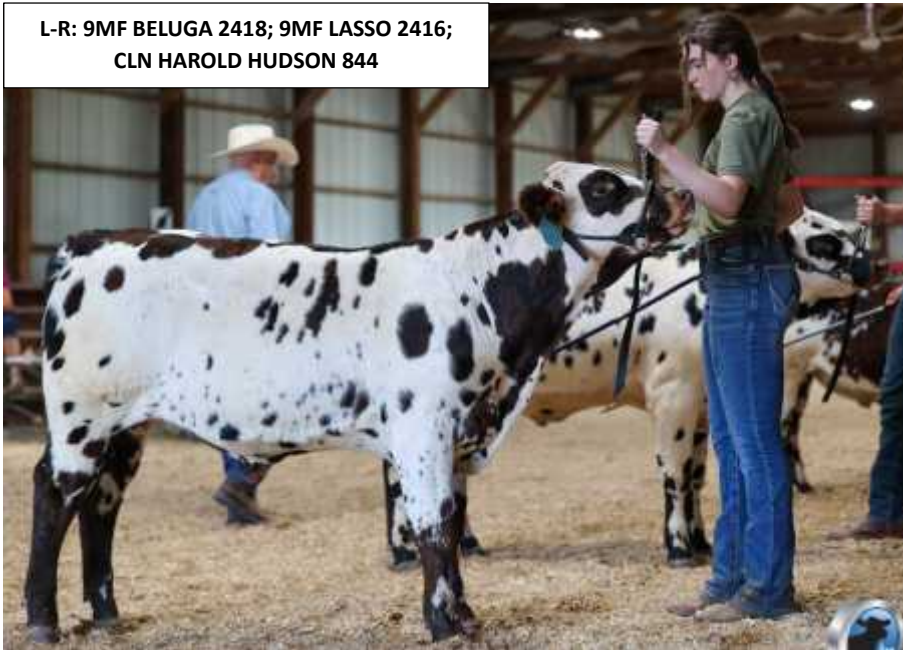
L-R: 9MF BELUGA 2418; 9MF LASSO 2416; CLN HAROLD HUDSON 844

The older Beef Junior Bull Calf Class also had three bulls in it. 9MF Lasso 2416, shown by Nine Mile Farm from Linwood, KS, placed first. His sire is Crick Ridge Dunkin Donut and his dam is Crick Ridge Echo 5E-17. Born 3-13-2024, he is 95% Normande. Standing in second place was 9MF Beluga 2418, also shown by Nine Mile Farm. A 93% Normande born 3-15-2024, his sire is Crick Ridge Dunkin Donut and his dam is PDM Rocket Celeste 328E. Placing third was CLN Harold Hudson 844. Exhibited by Cedar Lane Ranch, Greentop, MO, he is a 92% Normande son of CLN Melvin Harold 814. And his dam is CLN Maverick Masyn 797.