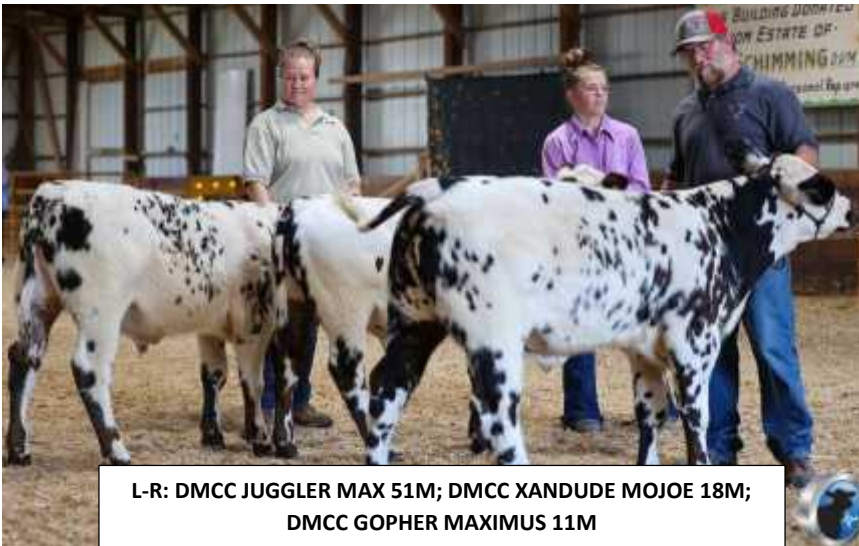
L-R: DMCC JUGGLER MAX 51M; DMCC XANDUDE MOJOE 18M; DMCC GOPHER MAXIMUS 11M

The first class in the Beef Show was the younger group of Beef Junior Bull Calves. The Beef Junior Calf Class was divided into two classes because of the age differences in the class. Bulls born after 05-01-2024 were shown in the younger class and bulls born between 01-01-2024 and 04-30-2024 were shown in the second class. The younger Beef Junior Bull Class consisted of three young bulls shown by Double M Cattle Company, LLC, from Rewey WI. Placing first was DMCC Gopher Maximus 11M. Born 5-12-2024, he is a 93% Normande son of DMCC Buccaneer Gopher 6G. His dam is DMCC Xaver Cupid 21C. In second place was