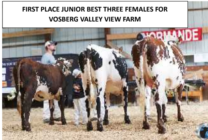
FIRST PLACE JUNIOR BEST THREE FEMALES FOR VOSBERG VALLEY VIEW FARM

Three breeders exhibited three heifers from their herd in the Junior Best Three Female Class. Placing first with their three females was Vosberg Valley View Farm, South Wayne, WI. Placing second with their Best Three Females was High-Gem Normandes, Neosho, WI. And in third place with their entry was Osinga Rosewood Farm, Janesville, WI.