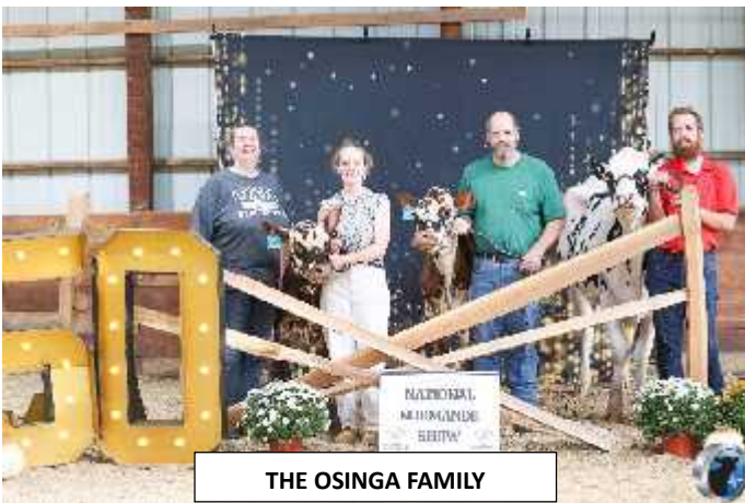
THE OSINGA FAMILY