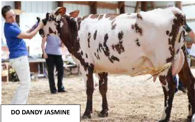
DO DANDY JASMINE

As already noted, the decision by the Wisconsin Department of Trade and Consumer Protection to require a testing protocol for any dairy cow in milk to attend a live dairy show seriously influenced the number of lactating dairy cows being exhibited at a show. NANA's National Show was no exception. Only one lactating dairy Normande was entered and shown during NANA's National Show. Do Dandy Jasmine, a milking three-year-old was exhibited by Do Dandy Dairy, Onalaska, WI. She was born 10-22-2021 and is 62.5% Normande. Her sire is Icarius and her dam is Do Dandy Josie.