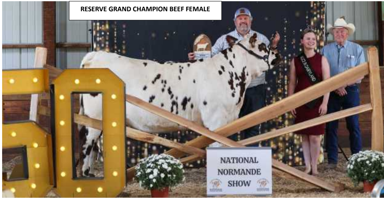
RESERVE GRAND CHAMPION BEEF FEMALE