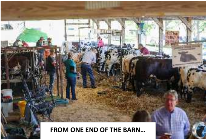
FROM ONE END OF THE BARN...