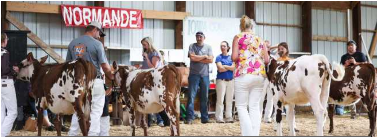
L-R: HIGH-GEM PILIER SEPHORA; RUDAN PORTSALL COSMIC 1655; THUNDERSTRUCK TULIP; FIAT RIDDICK PREMIER PETUNIA

The Dairy Spring Heifer Calf Class had four heifers in it that were 95% Normande or higher! Winning the class was High-Gem Piliier Sephora, born 3-18-2024. She is a 97% Normande sired by Piliier. Her dam is High-Gem Licorice Shakira. And she was exhibited by High-Gem Normandes, Neosho, WI. In second place was Rudan Portsall Cosmic 1655. 98.5% Normande she is a daughter of Portsall born 4-15-2024. Her dam is Rudan Loky Cokacola 1401 and she was exhibited by Vosberg Vally View Farm, South Wayne, WI. In third was Thunderstruck Tulip, born 3-31-2024. Shown by Thunderstruck Acres, Luxemburg, WI, she is 95% Normande. Her sire is Goose Hill Nemesis and her dam is Rudan Haliba Tequila. Placing fourth was Fiat Riddick Premier Petunia, a 99% Normande shown by Fiat Farm, Bethel, MN. Born 5-10-2024, her sire is Riddick and her dam is Miller Tyme Diva.