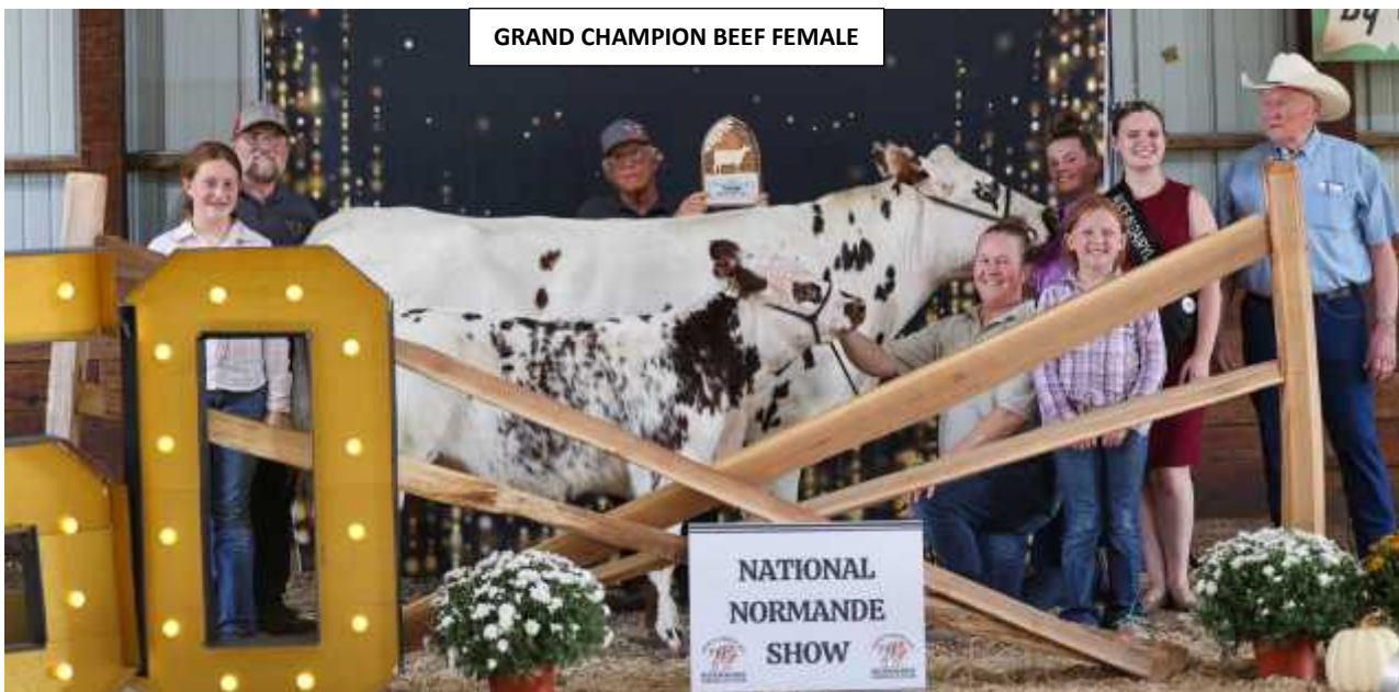
GRAND CHAMPION BEEF FEMALE